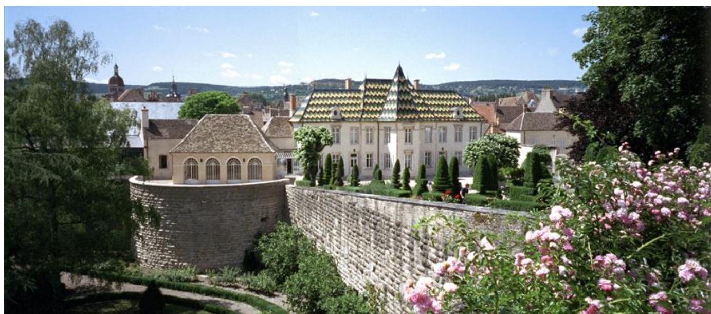
Château de Beaune